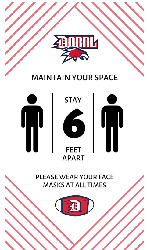
Graphic announcements as shown above will be displayed on one of the many digital boards present on the campus.

As another special addition, Doral Academy is selling face masks. Face masks aren't readily available to everyone so for $10 Doral will give you a reusable one. They can be picked up in the office and come in a design specific to the school. This is a simple way that students and faculty can show their school spirit. From regular disinfecting to Doral face masks, the school has made it so that our return will be as safe and seamless as possible.